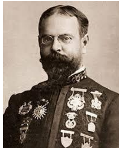
John Philip Sousa